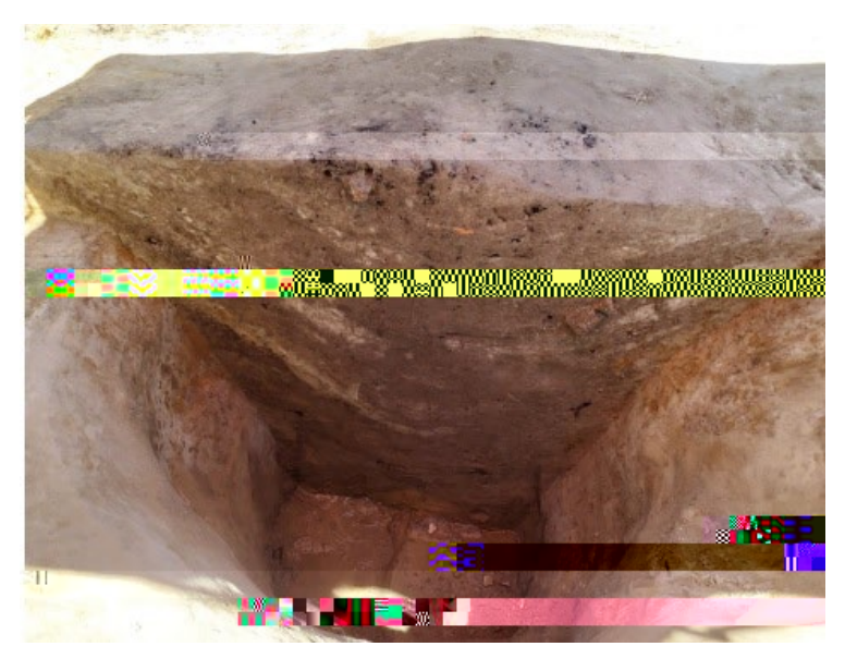
South profile of Feature 372 at 1MB513 showing the extent of the feature from the ground surface down to the water table

Feature 372 was a newly discovered barrel well at site 1MB513. It presented initially as a dark oval stain about 165cm by about 145cm, revealed during mechanical stripping. The central portion of the stain showed evidence of burning, including large pieces of charcoal. Colonial-era artifacts such as faience sherds were obvious on the surface. Upon excavation, the feature was revealed to be a column of many slumped-in moderately well-defined layers of feature fill. At the water table, about 94cm below the stripped surface, the bottom edge of the rotten barrel became evident as curving stains in the sand on the lower, outer edge of the feature fill. Below that, surviving fibers from the rotten barrel staves could be observed. Colonial-era artifacts continued sparsely to the water table. At that point, hand-excavation became too difficult, and mechanical excavation was employed – the remains of a partially-rotted barrel were pulled up in pieces.